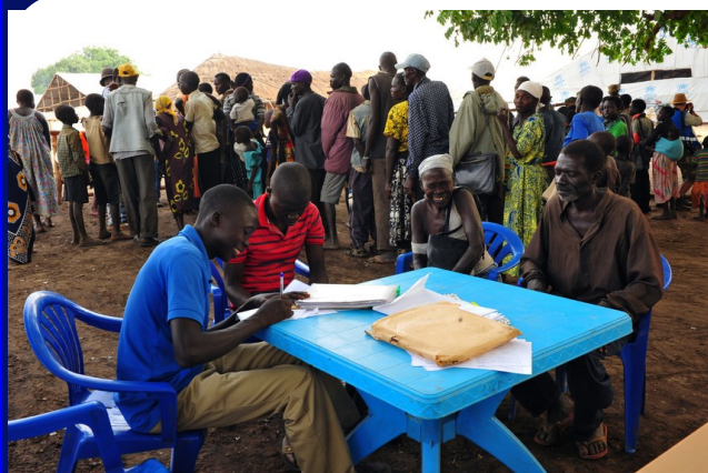
Photo: In Uganda, ACT Alliance records refugees with special needs.