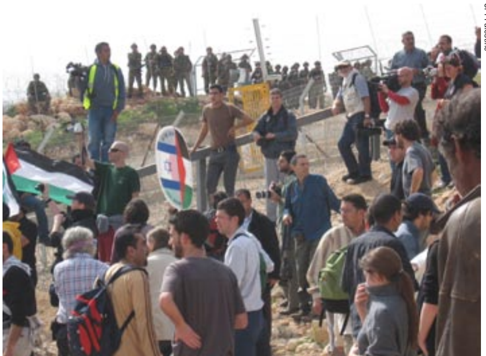
Bil'in 2007: protest continues

On April 28, 2005 a particularly large demonstration took place that included the Palestinian minister Fares Kadduri, and other well-known figures. Film footage.... showed how undercover agents, who look in the beginning like ordinary demonstrators, suddenly take