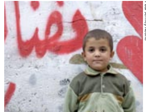
Small boy in a refugee camp in Gaza.

Olives have been grown in Palestine since biblical times and the production of olive oil has always been a mainstay of the economy. Over that time the olive has become a symbol of the identity and