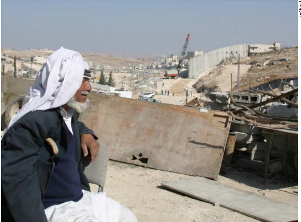
The wall encloses another suburb of East Jerusalem