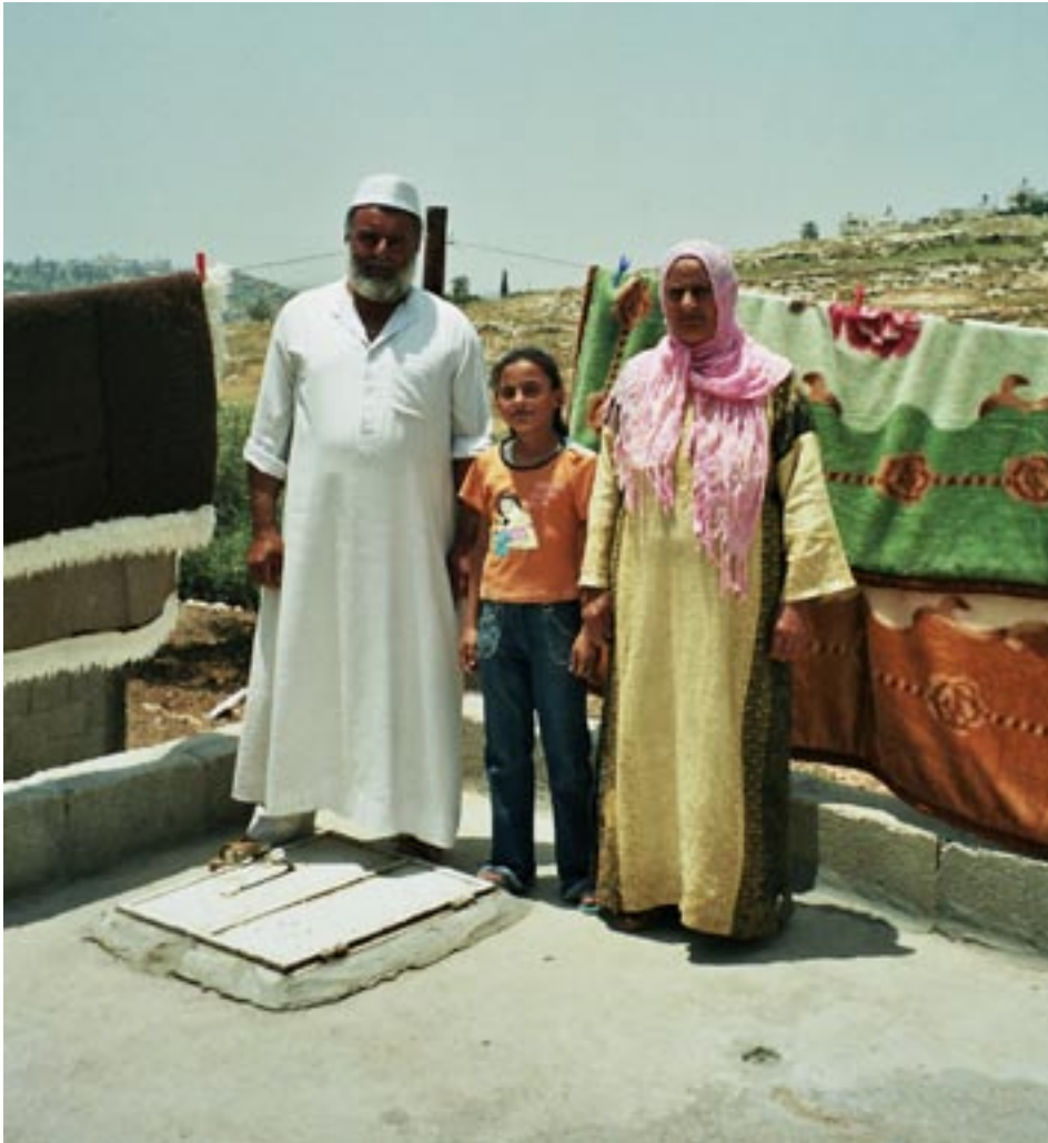
A family with their new water tank provided under the DSPR water cistern programme. Israeli settlers now take most of Palestine's water, causing severe shortages in many areas.