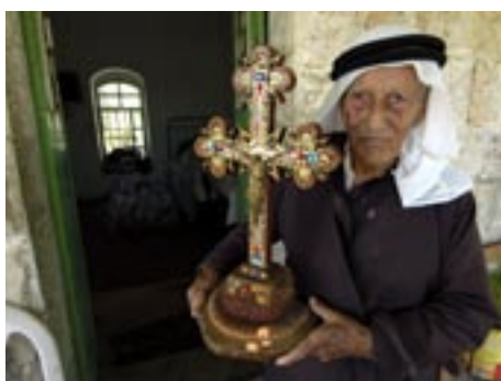
An elderly Palestinian Christian

administration was agreed for certain areas within the West Bank and the Gaza Strip under the Palestinian Authority (PA). Meanwhile Palestinian resistance to Israeli occupation erupted in the first, largely peaceful Intifada in 1987. In 2,000 the second Intifada began in response to continued human rights abuses and the continued expansion of illegal Israeli settlements. 1