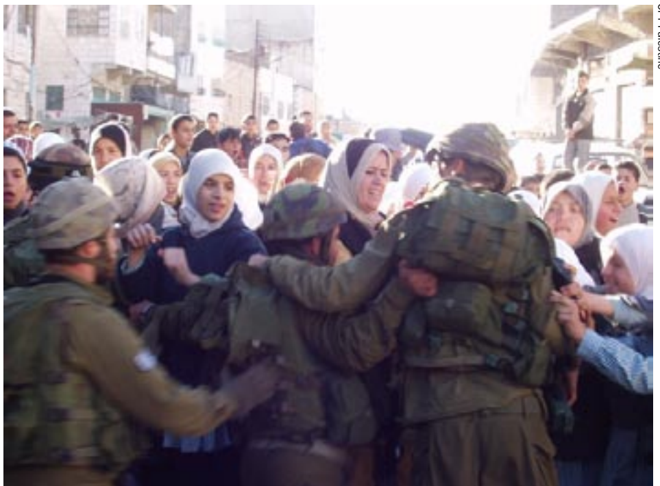
Schoolgirls and their teachers try to access their school in Hebron.

Israelis grabbed the undercover agents, only to find themselves arrested. ( http://gush-shalom.org/video/bilin )