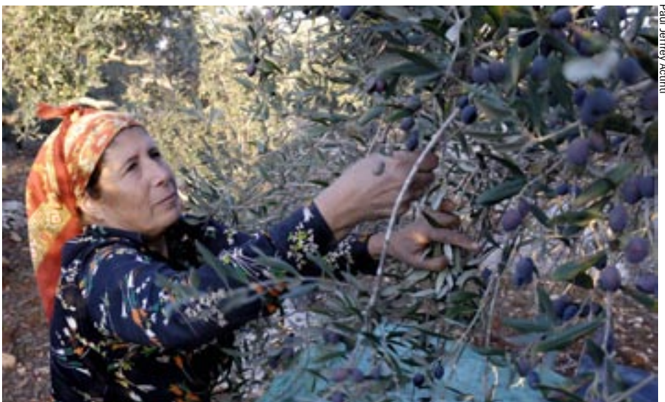
A woman picks olives for export as olive oil via fair trade networks.

(NZ Catholic Bishops, For a Just Peace in Palestine)