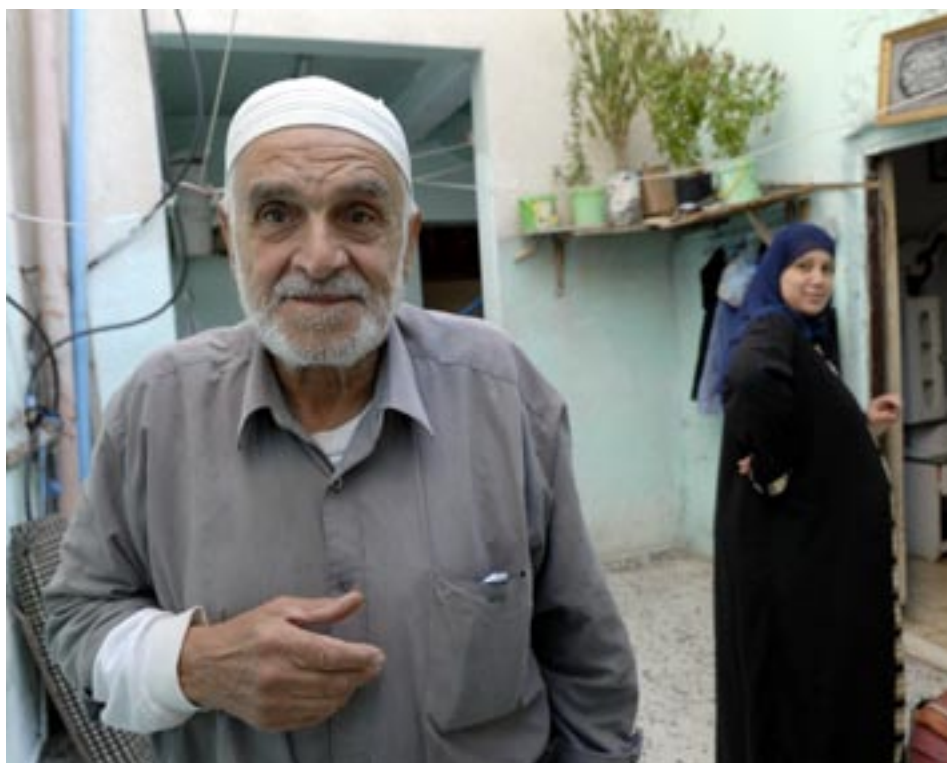
People living in a refugee camp, Gaza Strip.

(from The Jerusalem Declaration on Christian Zionism)