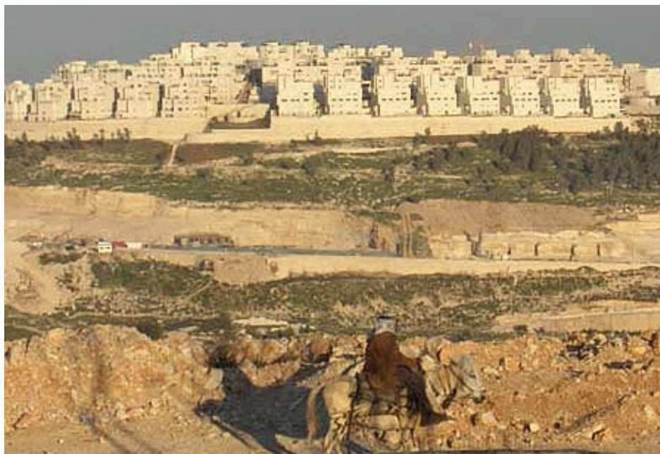
The Jewish settlement of Harhoma, one of a number built on Bethlehem land that now encircle the city.

Ariel Sharon, Israeli Foreign Minister, 15/11/1998, cited in Chain Reaction, No 4, 2006