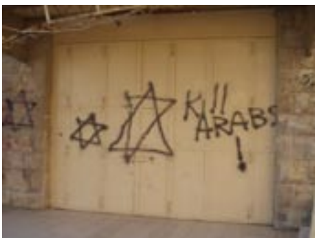
Racist graffiti is found both on Palestinian property and at checkpoints

The number of Christians in Jerusalem is falling rapidly as people flee from the stress of walls, checkpoints, house demolitions and pass regulations. Christians can emigrate more easily than Muslims.