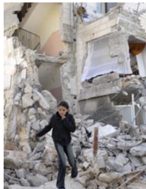
Paul Jeffrey: Act Intl.

Human rights groups estimated that more than 1,000 Palestinian olive trees were damaged or destroyed by settlers in the area during the 2003 October harvest. Some prominent Israelis condemned the attacks. However, the overall settlers' council decided that while it was wrong for settlers to wreck trees, it was acceptable for them to loot the olive crop "because Jews are entitled to harvest the produce of non-Jews in what the council defines as the Land of Israel" which includes the West Bank. (Guardian Weekly 20/11/03)